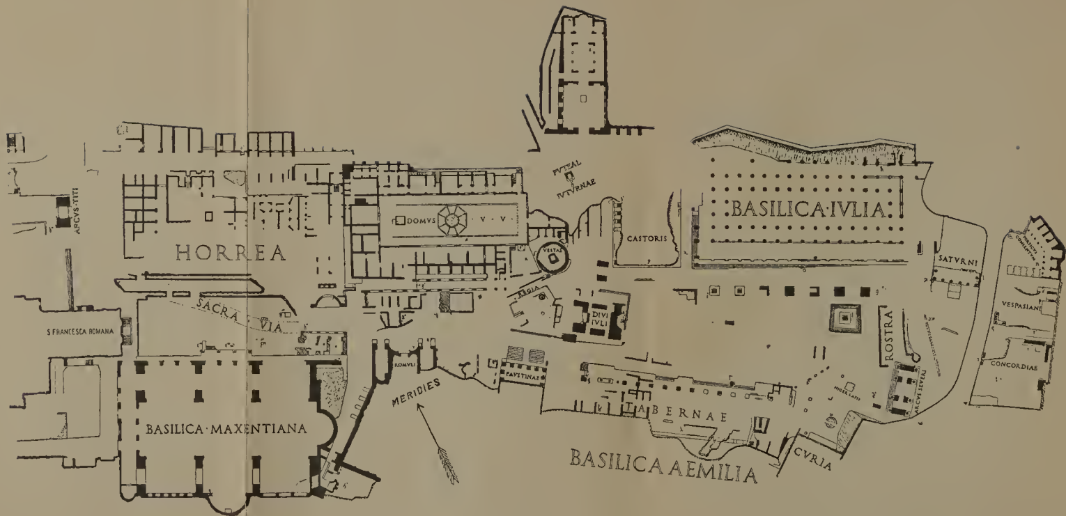
Fig. 386.—Plan of the ruins of the Roman Forum (executed by the Royal School of Engineers in Rome—G. Boni: Notizie degli Scavi , Giugno, 1900).